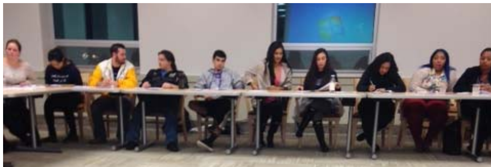
Over 30+ students, including our Mentees, participated in the $alary Negotiation Work$hop