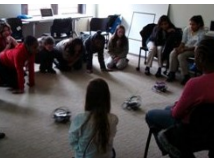
Robots playing ultrasonic cricket!