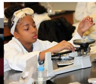
Hands-on cosmetics chemistry