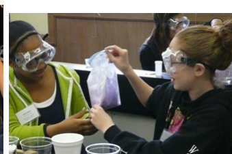
Kitchen is Full of Chemistry Too?