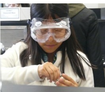
Creating a blizzard in a bottle