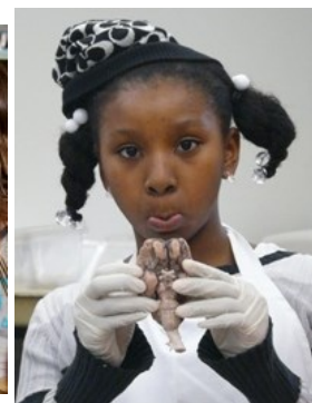
Learning how our brain works