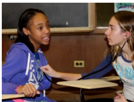
Listening to her heartbeat