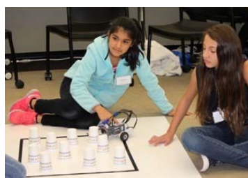
Programming a Robot in Build-a-Bot