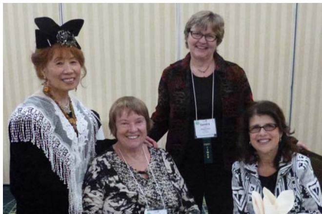
Victorian Heidi & 3 Other Friends