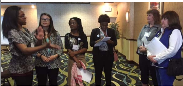
Next Generation Leadership: Students from our C/U Partners