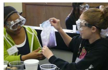
Kitchen is Full of Chemistry Too?