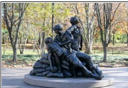
Photo credit: Vietnam Women's Memorial by Cliff (cliff1066), via Wikimedia Commons

Washington D.C remains a hub for cultural enrichment and many sites recognize the hardships and achievements of women throughout history. As you plan to attend the AAUW National Convention in D.C. in June 2017, consider allotting time to visit and be inspired by the extraordinary efforts of the women immortalized in these sites.