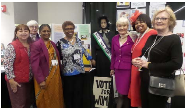
Empire State Virtual Branch Members