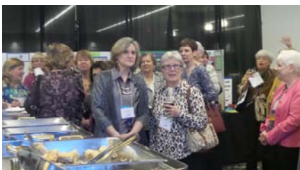
ESVB enjoyed the High Tea touring the Matilda Joslyn Gage Foundation!