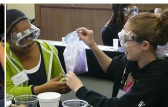
Kitchen is Full of Chemistry Too?