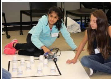
Programming a Robot in Build-a-Bot