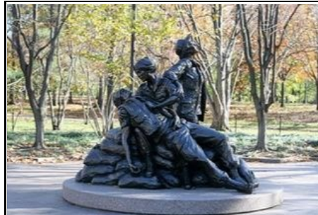
Vietnam Women's Memorial

Washington D.C remains a hub for cultural enrichment and many sites recognize the hardships and achievements of women throughout history. As you plan to attend the AAUW National Convention in D.C. in June 2017, consider allotting time to visit and be inspired by the extraordinary efforts of the women immortalized in these sites.