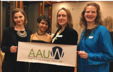
AAUW NYC Fellows