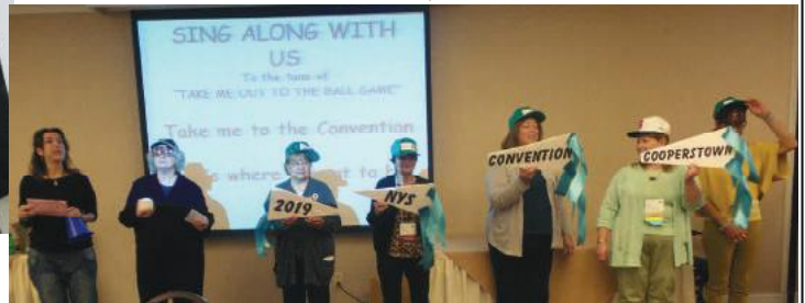
2019 AAUW NYS Convention, Cooperstown, NY!