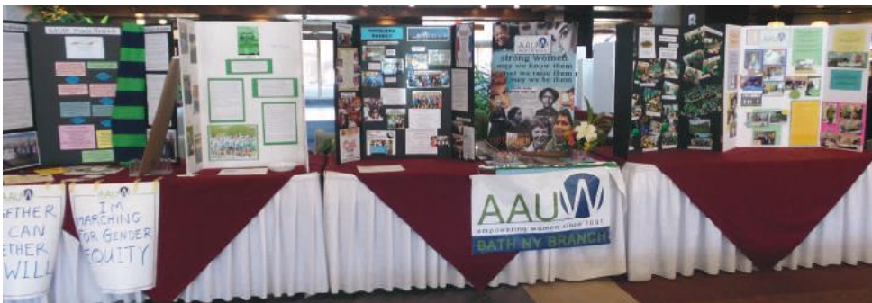
AAUW Branches Poster Displays