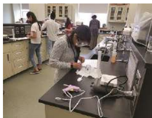
Blizzard in a Bottle!