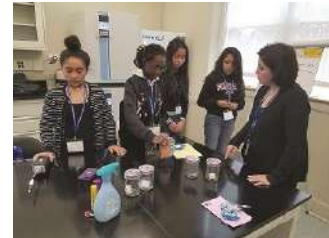
Lifting the Chemical Fingerprint