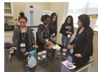
Lifting the Chemical Fingerprint