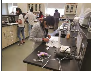
Blizzard in a Bottle!